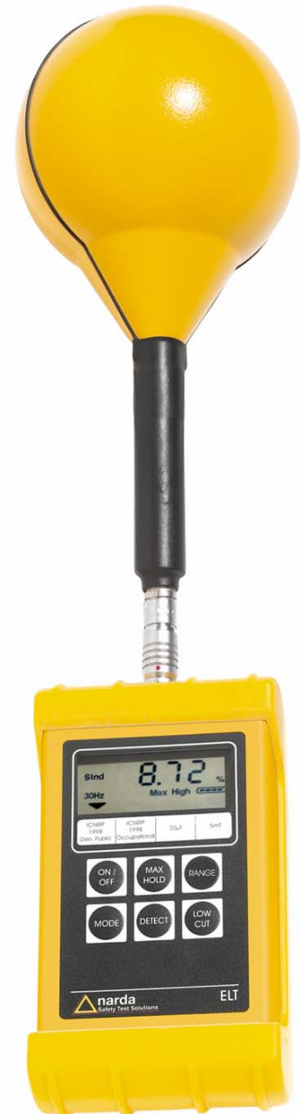
Exposure Level Tester ELT-400