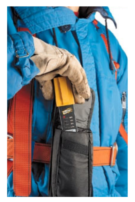
RadMan XT used as a personal monitor for radio frequency fields

As a locating unit all RadMan and RadMan XT versions can be used to locate leaks on waveguides and coaxial screw connectors (picture on the right). A non-conductive extension with handle is available as an optional accessory.