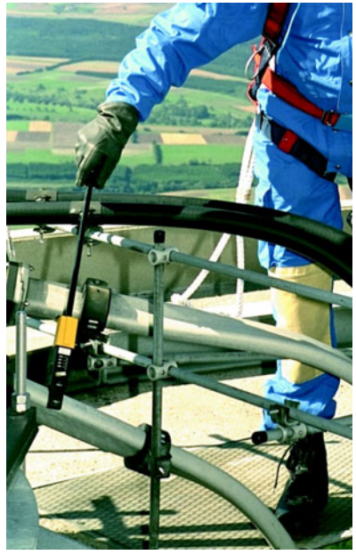
RadMan XT used as an instrument for leak detection