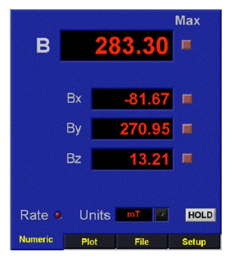
Example for a numerical results display

Magnetic flux density vs. time can be displayed as a graph. Measurement data can also be recorded to file.